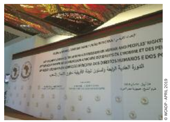
64th ACHPR Ordinary Session.

An invitation and agenda for an upcoming session is posted on the ACHPR website<sup>6</sup> at least four weeks ahead of the session. The ACHPR Secretariat also informs all NGOs with observer status of a session's time and agenda by email a couple of weeks in advance.