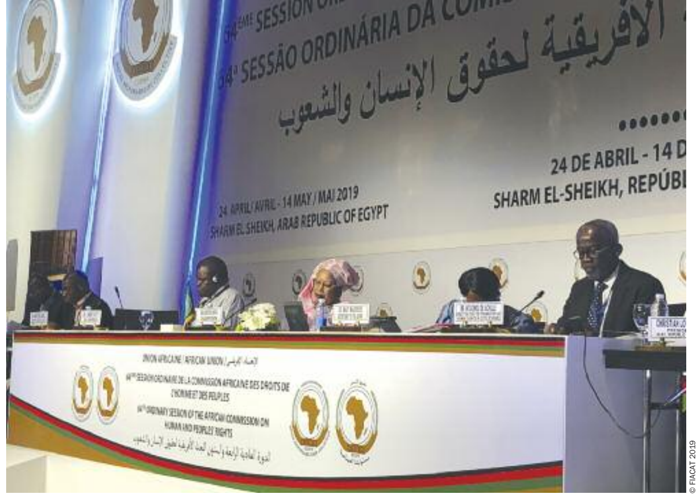
Organization of a panel on prisons at the 64<sup>th</sup> ACHPR Ordinary Session