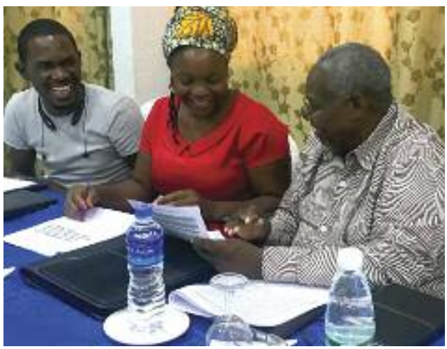
Training workshop on the workings of the ACHPR, in the margins of the 65<sup>th</sup> Ordinary Session