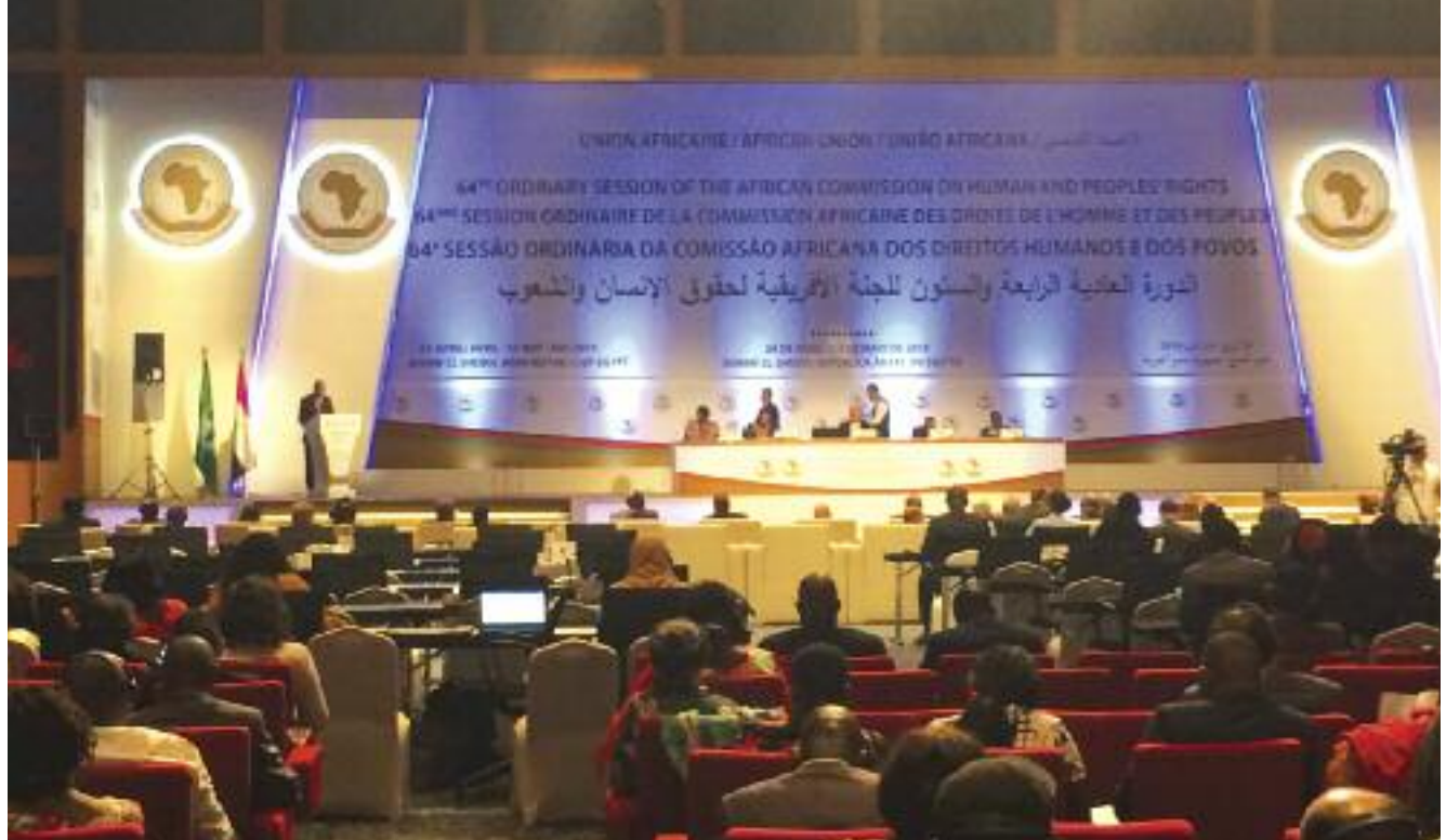
64th ACHPR Ordinary Session

The first week is dedicated to public sessions. It begins with an opening ceremony where the resolutions adopted by the NGOs Forum are publicly presented<sup>6</sup>.